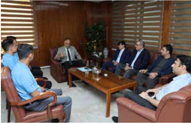
Prof Ahsan Iqbal Chaudhary, met the two astronauts selected for Pakistan's first human space mission under SUPARCO's Human Spaceflight Program.