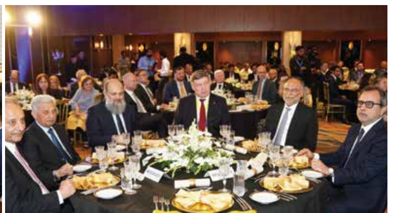
The Planning Minister at the EU-Pakistan Business Forum dinner