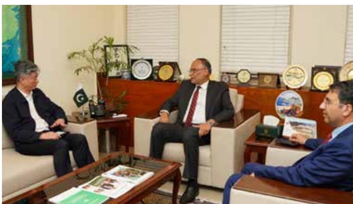
Federal Minister Prof. Ahsan Iqbal in a meeting with MD China Energy in Islamabad