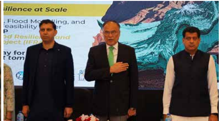
The Minister at a high-level workshop under IFRAP,