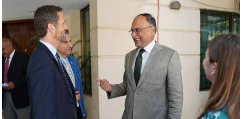
Federal Minister Prof Ahsan Iqbal Chaudhary, in discussions with a delegation from UNOPs