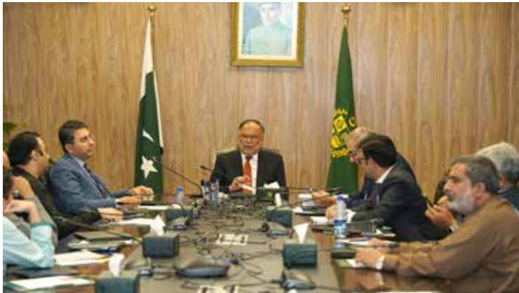
A high-level meeting "Review of Scenario Based Planning" chaired by the Planning Minister.