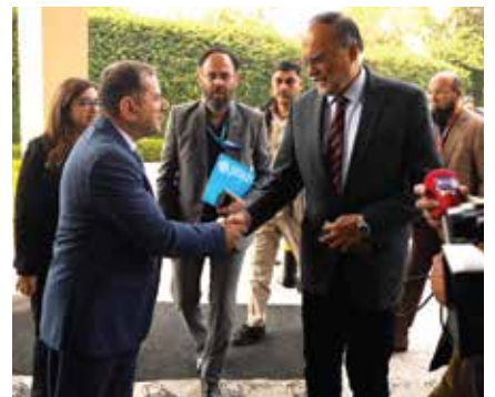
Federal Minister Professor Ahsan Iqbal's address at a conference on "Data-based policymaking and protecting the basic needs of children in Pakistan"