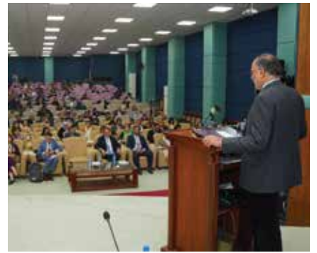
Federal Minister Professor Ahsan Iqbal Addressing the International Education Conference held at Allama Iqbal Open University,