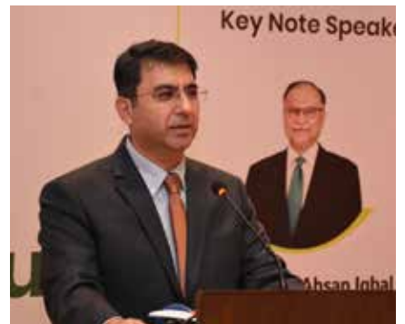
Federal Minister Professor Ahsan Iqbal, while addressing the National Consultative Meeting 2026 today, declared the year 2026 as the "Year of Reforms".