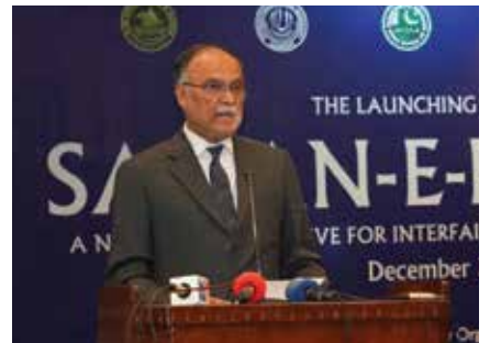
"Saiban-e-Pakistan" was formally launched at Faisal Masjid, Islamabad, in collaboration with the Peace and Development Unit of the Ministry of Planning, Development and Special Initiatives, Islamic Research Institute, Faisal Masjid and International Islamic University Islamabad (IIUI).