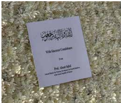
Federal Minister Professor Ahsan Iqbal, representing Pakistan, visited the grave of former Prime Minister Begum Khaleda Zia and laid a wreath.