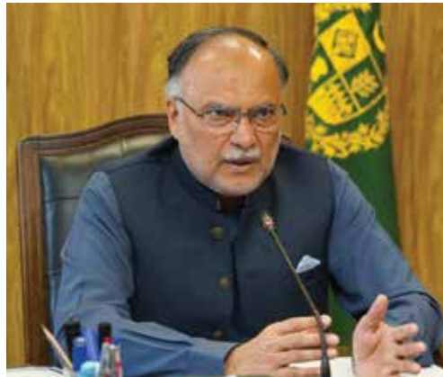
Prof. Ahsan Iqbal chaired the meeting of Commemoration of National Intellectual Legacy