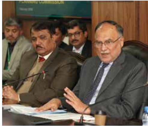
Prof. Ahsan Iqbal chaired the meeting of 3 rd MCMC. Senior Officials from the Ministry have also attended.