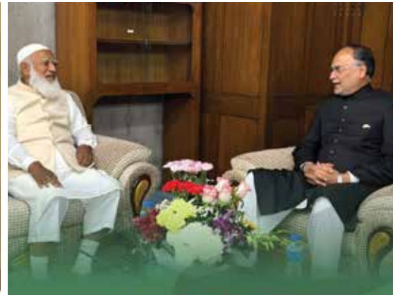
Federal Minister Prof Ahsan Iqbal met Leader of the Opposition Dr. Shafiqur Rahman, representing Prime Minister Shehbaz Sharif.