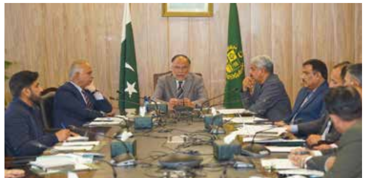
Federal Minister for Planning, Development & Special Initiatives, Professor Ahsan Iqbal, chaired Price Monitoring Committee