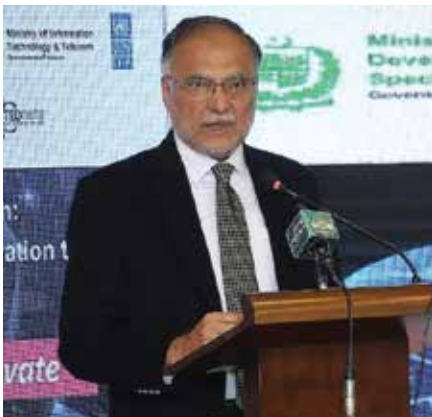
Federal Minister for Planning, Prof. Ahsan Iqbal addressing on the occasion of Indus AI Week, a unique workshop was held