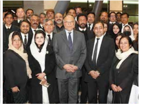
The Islamabad High Court Bar Association awarded Lifetime Honorary Membership to Federal Minister Prof. Ahsan Iqbal