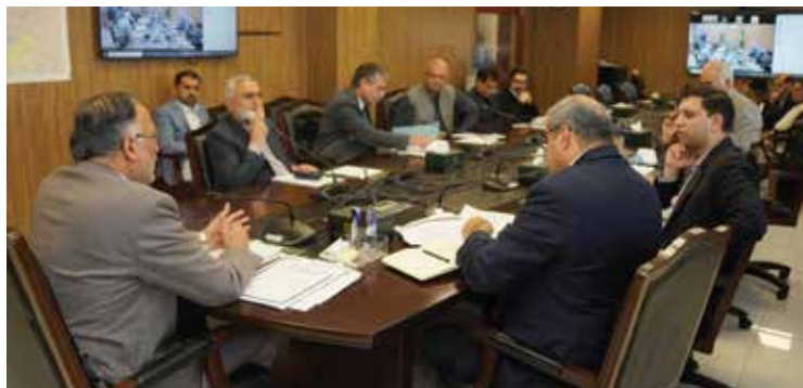
Federal Minister for Planning and Development Prof. Ahsan Iqbal Chaired a meeting on Diamer Bhasha Dam