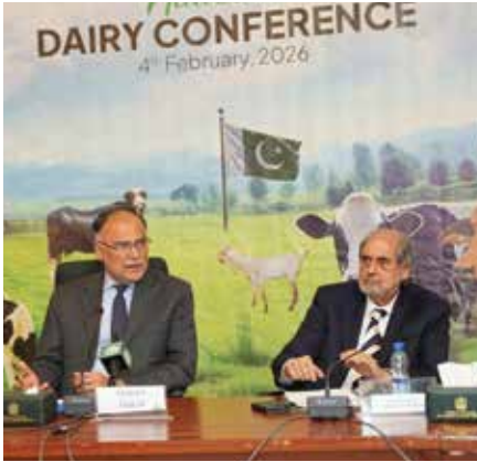
Federal Minister for Planning, Prof. Ahsan Iqbal addressing the National Dairy Conference