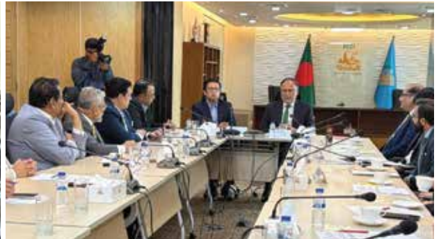
Federal Minister for Planning, Professor Ahsan Iqbal, held a detailed discussion on transforming economic cooperation between Pakistan and Bangladesh into a practical partnership in an important and fruitful meeting with the Dhaka Chamber of Commerce and Industry.