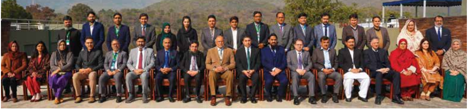
Concluding the 3-Day PIDE Leadership Excellence Workshop, Ahsan Iqbal graced the occasion with his presence, reaffirming the government's commitment to nurturing visionary leadership and strengthening institutional excellence for Pakistan's future.