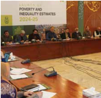
Federal Minister for Planning, Prof. Ahsan Iqbal addressing at the launch of Poverty & Inequality Estimates 2024-25