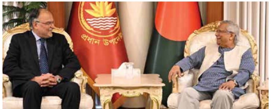
Federal Minister Ahsan Iqbal, during his official visit to attend Bangladesh's Prime Minister-Elect's oath-taking ceremony, held a cordial and constructive meeting with Chief Adviser Professor Muhammad Yunus.