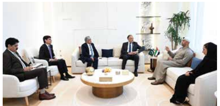
Federal Minister for Planning, Development & Special Initiatives, Professor Ahsan Iqbal, meets UAE Deputy Minister of Cabinet Affairs