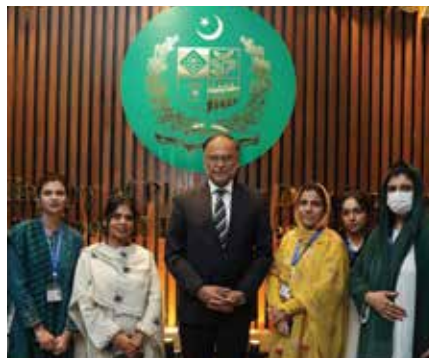
Federal Minister Professor Ahsan Iqbal with the participants of National Workshop KP