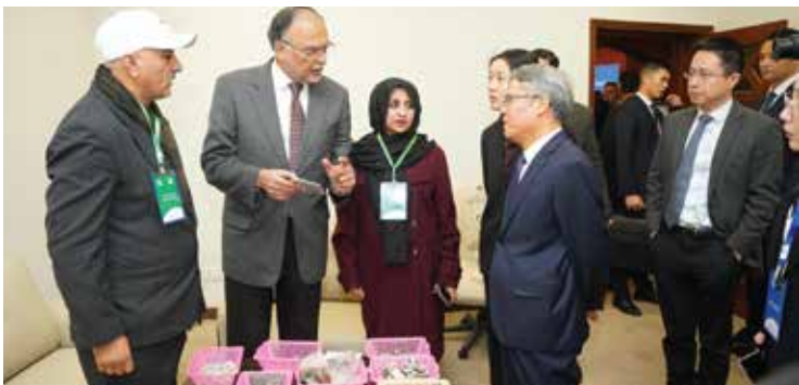
Federal Minister for Planning and Development Prof. Ahsan Iqbal met with the Ambassador of China at the Launching ceremony of the E-mining platform