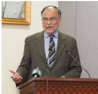
Federal Minister Prof. Ahsan Iqbal addressing the participants during NIPA Visit