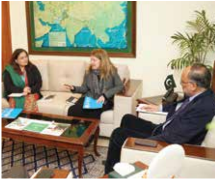
Prof. Ahsan Iqbal in a meeting with Country Representative UNICEF