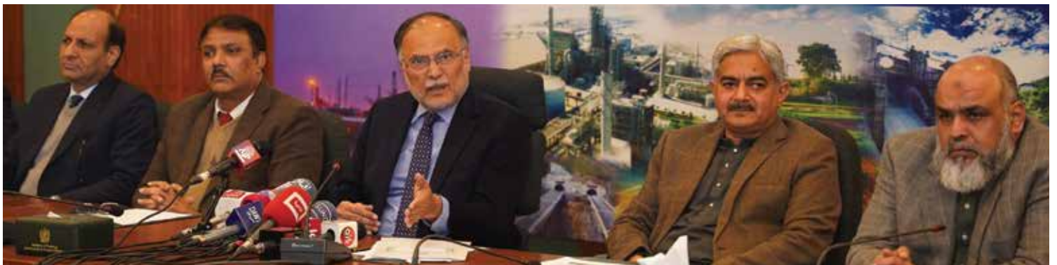
"Monthly Development Update" was formally launched at the Ministry of Planning, Development and Special Initiatives by Minister Ahsan Iqbal with collaboration of senior officers from the ministry.