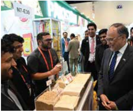
Federal Minister, Prof. Ahsan Iqbal led Pakistan's participation at Gulfood 2026