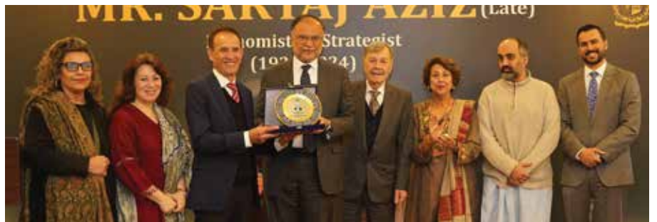
The Ministry of Planning organized a memorial ceremony on the occasion of the second death anniversary of Mr. Sartaj Aziz, in which Sartaj Aziz's family members also participated. The ceremony paid tribute to his services as a visionary economist and distinguished politician.