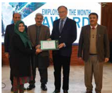
MoPD&SI organized the "Employee of the Month" ceremony to recognize and reward outstanding performance and dedication