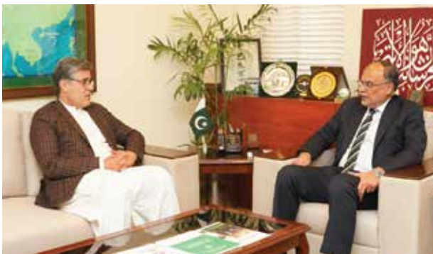
Call on Pakistan's Ambassador to China