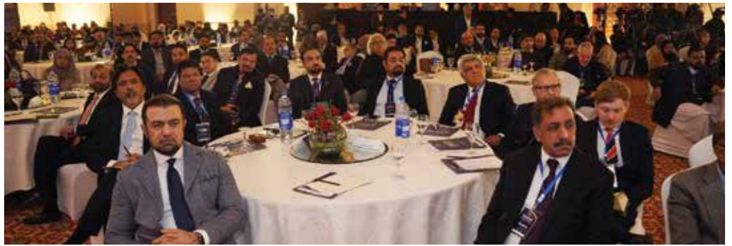
Federal Minister Professor Ahsan Iqbal Addressing the IPakistan Policy Dialogue Conference held in Islamabad