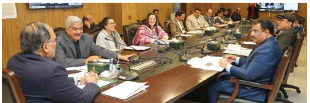
Federal Minister Ahsan Iqbal chaired the meeting of the Poverty Estimation Committee to review key indicators and policy measures.