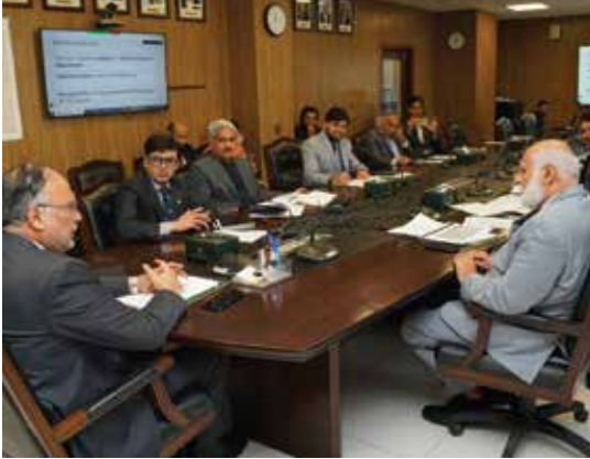
Eighth meeting of the Task Force on the Faculty Pay Scale System in Higher Education, chaired by Federal Minister Prof. Ahsan Iqbal.