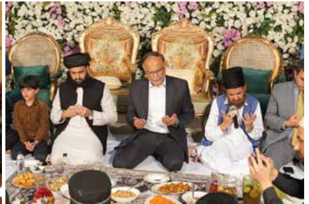
The Minister noted that the holy month (Ramazan) provides an opportunity for reflection, spiritual growth, and unity within society.