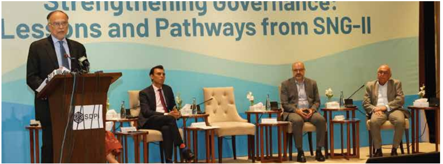
Federal Minister Prof. Ahsan Iqbal delivered a keynote address at a governance dialogue organized by the Sustainable Development Policy Institute (SDPI) in collaboration with UNDP Pakistan and the UK's Foreign, Commonwealth and Development Office.