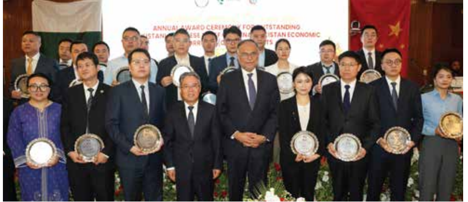
The Annual Awards Ceremony 2026 hosted by the MoPD&SI, celebrating the achievements of professionals contributing to the CPEC and reinforcing the strategic partnership between Pakistan and China.