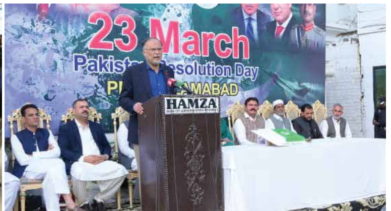
During a ceremony commemorating Pakistan Resolution Day, the Planning Minister paid tribute to the sacrifices made by the country's founding generation.