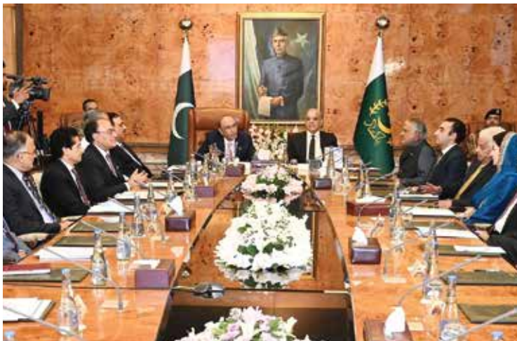
President Asif Ali Zardari convened a high-level consultative meeting with Prime Minister Shehbaz Sharif, to review Pakistan's economic, energy, and regional outlook. Prof. Ahsan Iqbal participated in the deliberations.