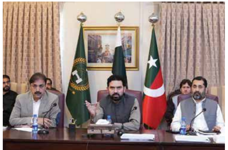
The second Joint Steering Committee meeting for the Special Development Program for Former FATA Districts reviewed progress on initiatives aimed at accelerating socio-economic development in the region.