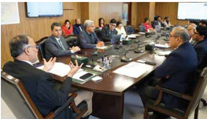
The Senior Management Committee of the Ministry held an important meeting to review Pakistan's development strategy in light of evolving geopolitical tensions and global economic challenges.