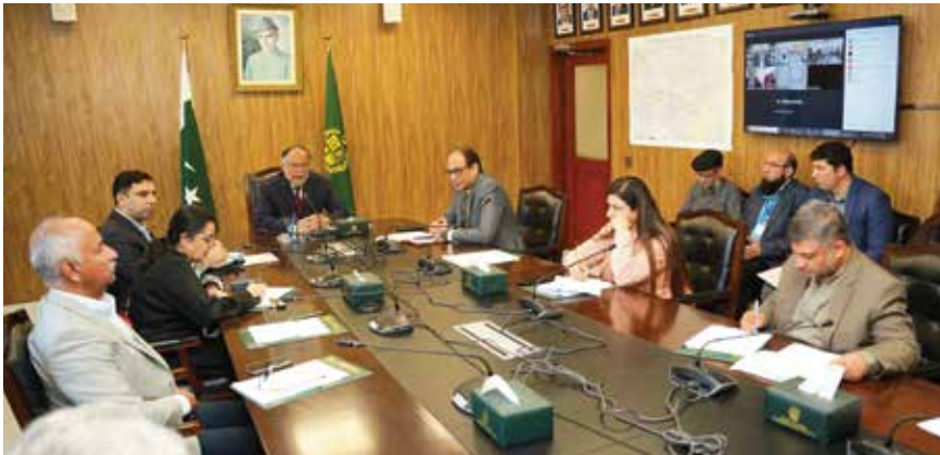
A high-level meeting chaired by the Planning Minister reviewed preparations for the 150th birth anniversaries of Quaid-e-Azam Muhammad Ali Jinnah and Allama Muhammad Iqbal.