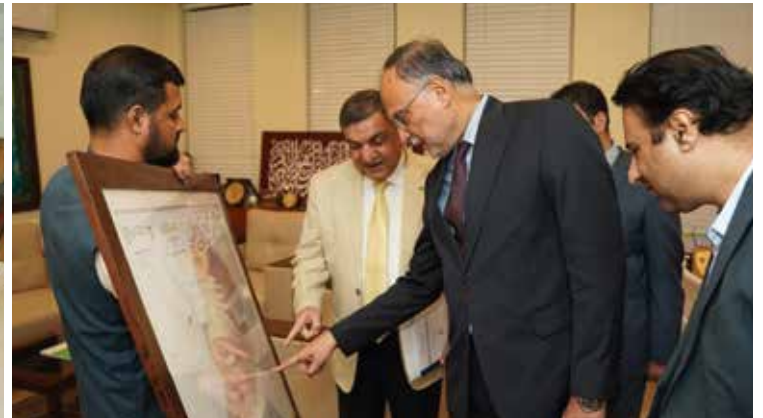
The Minister, in discussions with Surveyor General of Pakistan (SG)