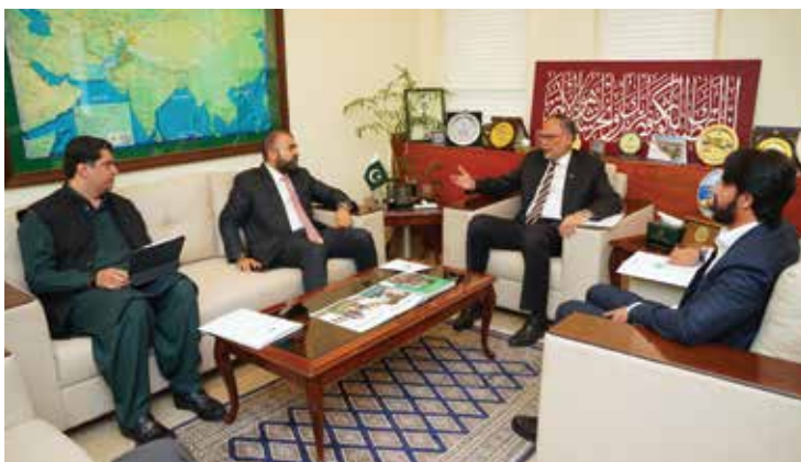
Federal Minister Prof. Ahsan Iqbal in a meeting with Chief Minister of Balochistan, Mir Sarfraz Ahmed Bugti