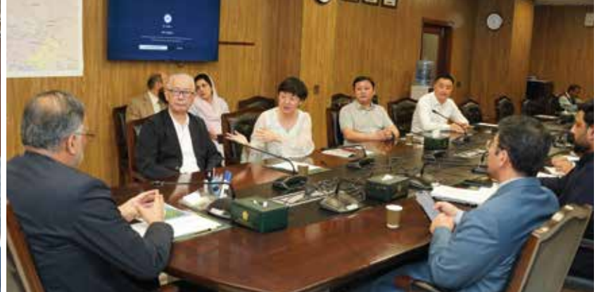
Federal Minister Prof Ahsan Iqbal Chaudhary, in discussions with the Chairman Fashion group China