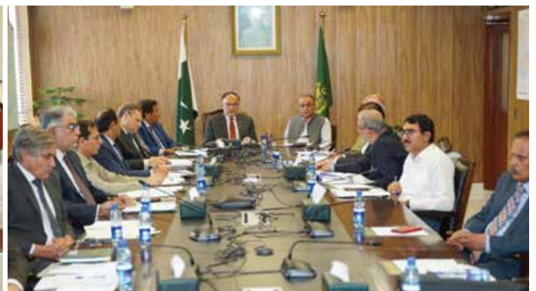
The Planning Minister, Prof Ahsan Iqbal chairing a high level meeting on "Climate Flood Emergencies"