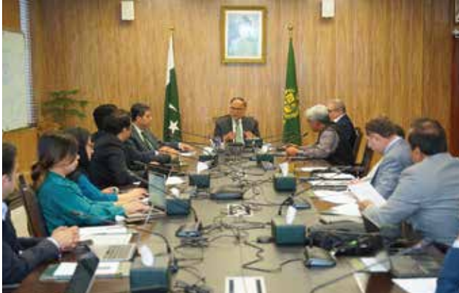
A high-level meeting on "Export Roadmap" chaired by the Planning Minister.