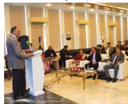
Professor Ahsan Iqbal addressing at the launching of Peace & Development Unit (PDU)