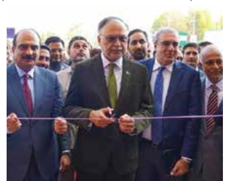
Minister Ahsan Iqbal inaugurates the second Data Fest 2025 organized by PBS.