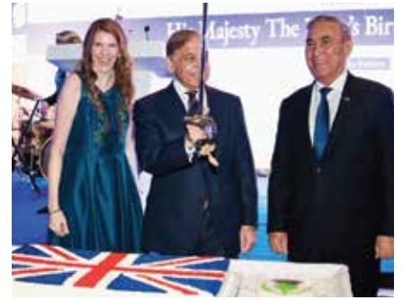
PM Shahbaz Sharif at King Charles III Birthday Event