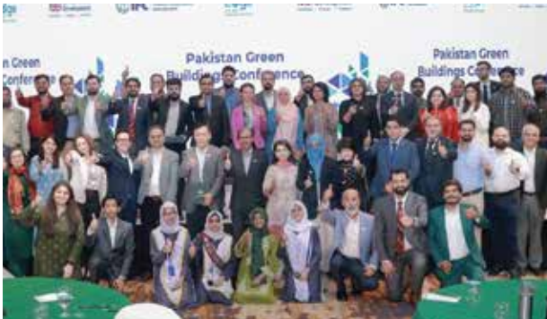
The Pakistan Green and Resilient Building Conference 2025, hosted by IFC - International Finance Corporation