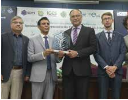
Planning Minister at inaugural plenary of the 4-day 28th Sustainable Development Conference