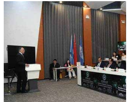
Pakistan proposes 10,000 joint PhD scholarships with China under CPEC phase-II