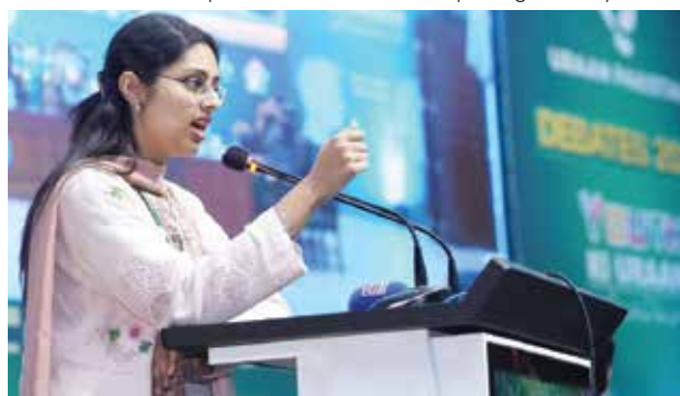
Student addressing at URAAN Pakistan Debates 2025