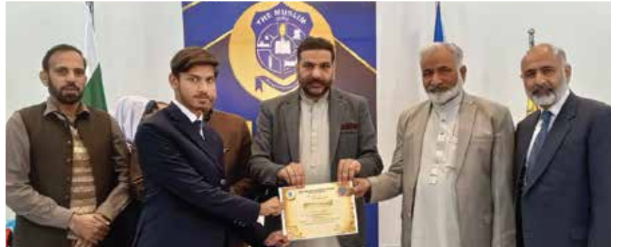
Annual Seerat Ul Nabi Quiz Competition