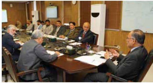
Planning Minister calls for Proactive Planning Ahead of Ramadan,