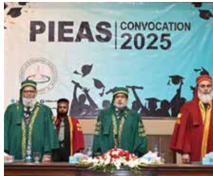
11th Convocation Ceremony PIEAS