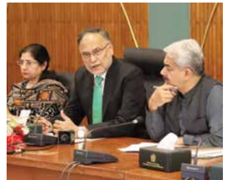
Minister chairs meeting in Islamabad, urging reforms and alignment with URAAN Pakistan