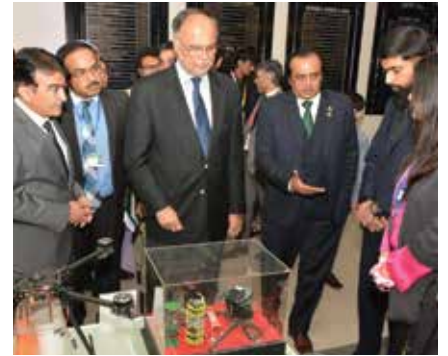
Prof. Ahsan Iqbal at the International Conference on Space and Technological Applications organized by SUPARCO.