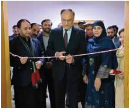
Minister Ahsan Iqbal, officially inaugurated the Cancer Facility at the Pakistan Atomic Energy Commission's Institute of Nuclear Medicine, Oncology and Radiotherapy and Ski and Sports Tourism Center at Karakoram International University (KIU) Gilgit.