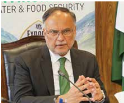
Minister Ahsan Iqbal Accelerates Launch of Seerat Chair and Gender Studies Centre to Promote Research and Youth Development