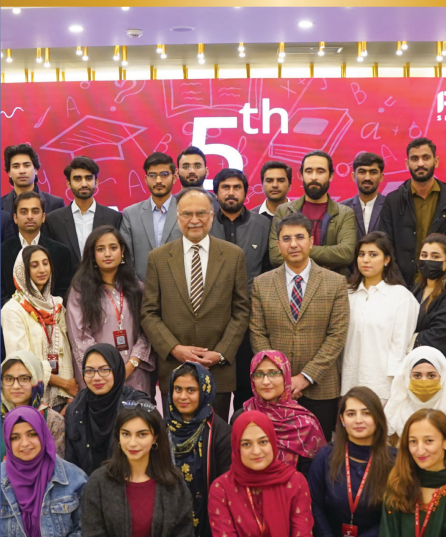
Planning Minister Urges Research for Export Growth at RASTA-PIDE