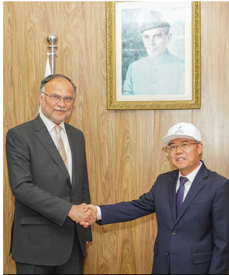
Ahsan Iqbal and Chinese Ambassador Discuss Future Areas of Collaboration