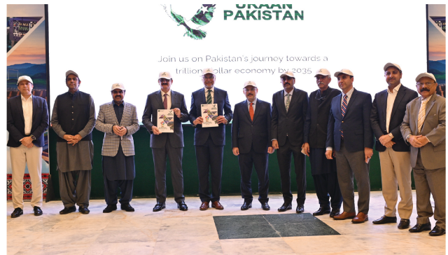
Federal Minister Ahsan Iqbal along with CM Sindh and other officials at the Provincial Workshop