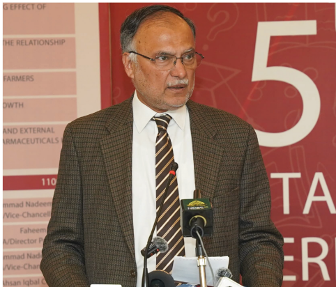
Federal Minister Ahsan Iqbal addressing at the RASTA-PIDE Conference

Federal Minister Ahsan Iqbal challenged researchers to drive export growth through scientific planning and evidence-based policymaking at the 5th RASTA-PIDE Conference. He emphasized research relevance, industrial clusters, and global competitiveness to strengthen Pakistan's trade.