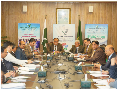
Planning Minister while chairing a meeting on price stability

Federal Minister Ahsan Iqbal chaired a high-level meeting to ensure price stability of essential commodities, including ghee and sugar, during Ramadan and Eid. He directed authorities to curb hoarding and profiteering, ensuring uninterrupted supply and relief for the public.