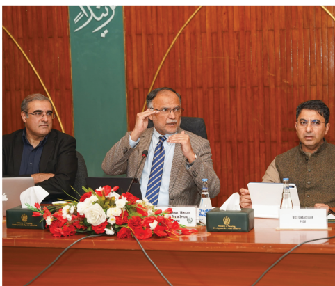
Federal Minister Ahsan Iqbal addressing the Central Development Working Party.

The Central Development Working Party (CDWP), chaired by Minister Ahsan Iqbal, approved development projects worth Rs. 49.3 billion and recommended Rs. 19.96 billion to ECNEC, bringing the total cost to Rs. 69.27 billion.