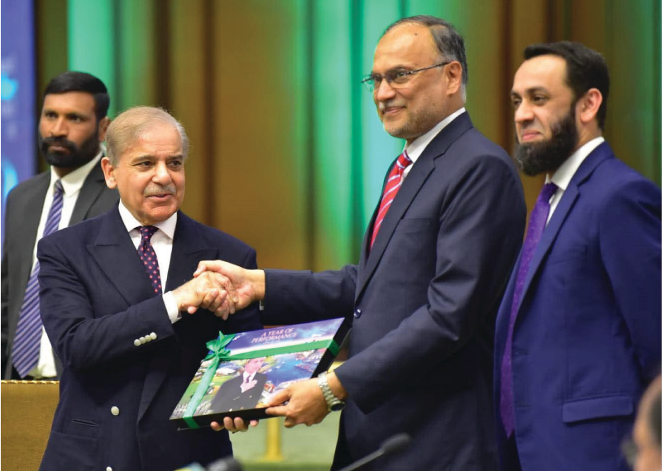
Federal Minister Ahsan Iqbal and Federal Minister Ataullah Tarar present one-year performance to PM Shehbaz Sharif

Prime Minister Muhammad Shehbaz Sharif was presented with a book on the one-year performance of the government by Minister for Planning, Development & Special Initiatives Ahsan Iqbal and Minister for Information & Broadcasting Ataullah Tarar during the Special Meeting of the Cabinet at Jinnah Convention Center Islamabad.