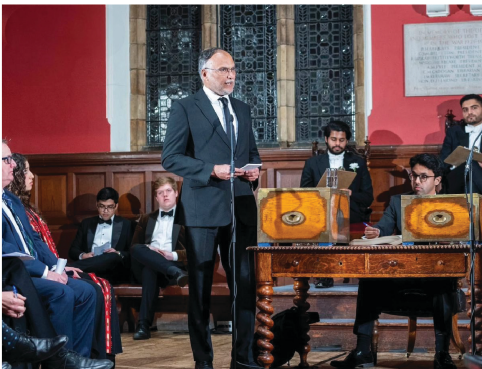
Federal Minister Ahsan Iqbal addressing after a victory at Oxford Union Debate in London

In a major intellectual milestone, Minister Ahsan Iqbal secured a victory at the Oxford Union debate, where he passionately argued on issues related to the challenges faced by the Global South in the current global economic and political landscape. His speech focused on the need for economic justice, fair global governance, and equitable opportunities for developing nations. His arguments resonated with the audience, leading to a decisive win. This achievement positioned Pakistan as a strong voice in international discussions on economic disparity and governance reforms.