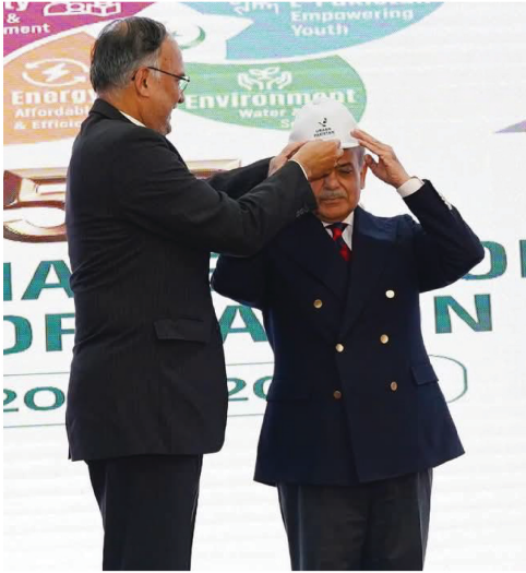
Ahsan Iqbal presents Uraan Pakistan cap to PM Shehbaz Sharif

Prime Minister Muhammad Shehbaz Sharif launched the five-year National Economic Transformation Plan, "Uraan Pakistan," aimed at achieving sustainable, export-led growth through the 5Es—Exports, e-Pakistan, Environment, Energy, and Equity & Empowerment.