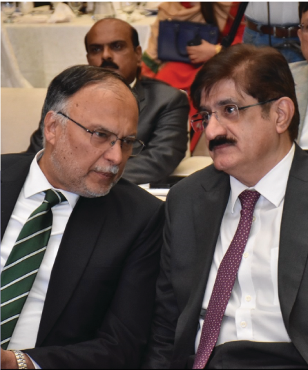
Consultative Workshop on "Uraan Pakistan" Held in Karachi