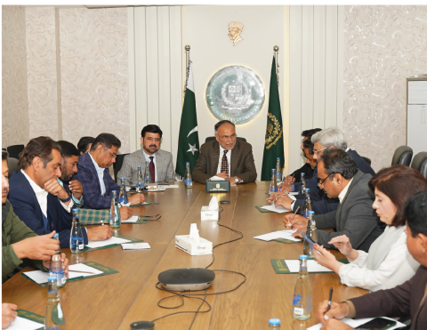
Federal Minister Ahsan Iqbal addressing the journalists

Planning Minister Prof. Ahsan Iqbal outlined the government's strategic direction under URAAN Pakistan during a roundtable with leading journalists. He emphasized the media's crucial role in supporting national development and informing the public about key government initiatives.