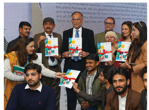
Federal Minister Ahsan Iqbal launches National ECD Policy Framework and SUN Youth Network

In collaboration with UNICEF and GAIN, the initiative focused on holistic childhood development across 34 districts, aligning with World Health Assembly (WHA) targets. Key stakeholders, including government officials and youth representatives, emphasized the importance of nutrition, early development, and youth engagement in policymaking. The event reinforced collaborative efforts to implement the framework and strengthen child well-being nationwide.