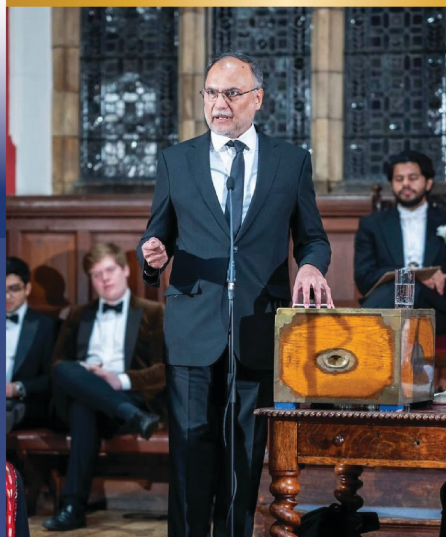
Ahsan Iqbal Triumphs at Oxford Union Debate