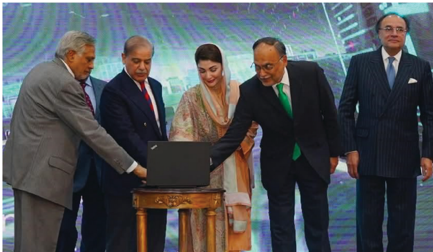
PM Shehbaz Sharif, Vice PM Ishaq Dar, CM Punjab Maryam Nawaz, Federal Minister Ahsan Iqbal and Federal Minister Aurangzeb launch "URAAN PAKISTAN" Website

The prime minister emphasized that, having achieved macroeconomic stability, the government would now focus on accelerating economic growth through targeted investments and reforms in key sectors, including IT, agriculture, exports, and mining. He stressed that national unity and political harmony were essential for the plan's success, which sought to create a business-friendly environment and incentivize private sector investment. He vowed to increase annual investment to $10 billion and make export-led growth the foundation of Pakistan's economic revival.