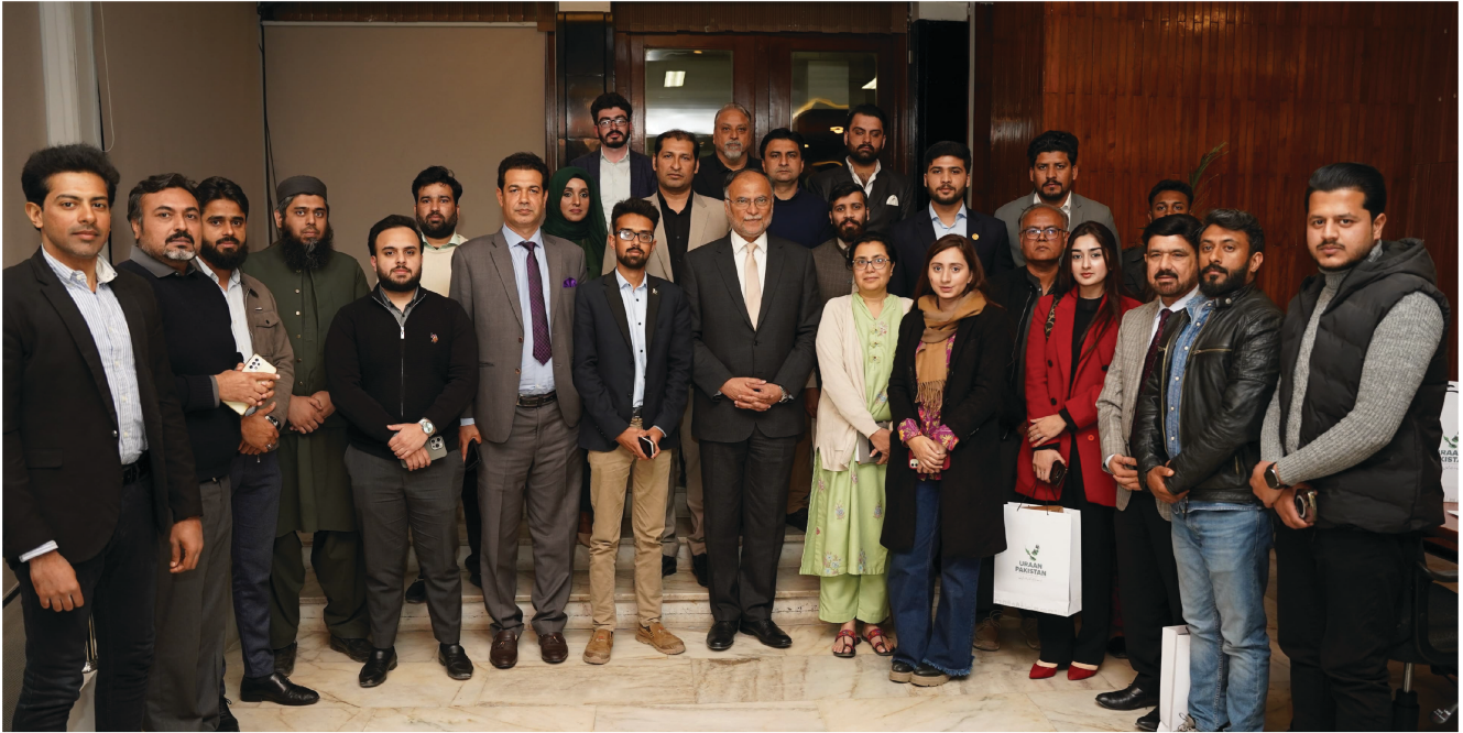
Planning Minister Prof. Ahsan Iqbal meets digital influencers in Islamabad

Planning Minister Prof. Ahsan Iqbal urged digital influencers to use social media responsibly, counter polarization, and promote national unity. In the meeting with digital influencers he highlighted the power of digital platforms in shaping narratives and warned against misinformation and identity politics.