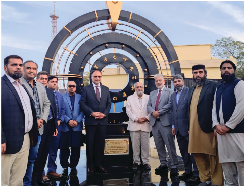
Federal Minister, Ahsan Iqbal Inaugurates Astrolabe Data Centre, at NED University

Federal Minister Ahsan Iqbal inaugurated the Astrolabe Data Centre at NED University, a key initiative under the E-Pakistan program aimed at strengthening Pakistan's technological infrastructure. The centre will support big data analytics, Maktab ERP solutions, and high-performance computing services at subsidized rates for students and researchers. The event brought together academic and industry leaders to drive Pakistan's digital transformation and innovation agenda.