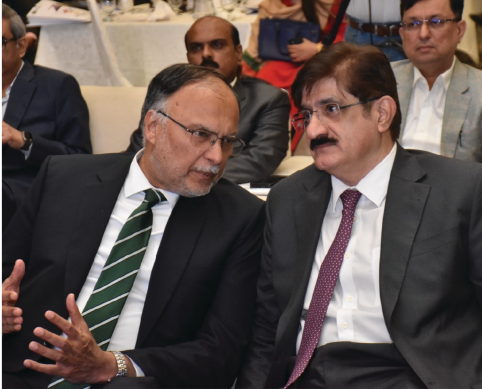
Federal Minister Ahsan Iqbal in conversation with CM Sindh Murad Ali Shah during the workshop

The federal government launched the first consultative workshop on "Uraan Pakistan" in Karachi, bringing together key stakeholders to drive economic expansion, industrial growth, and digital transformation. Federal Minister Ahsan Iqbal highlighted major initiatives, including enhancing exports, leveraging Thar coal and renewable energy, and strengthening trade infrastructure with projects like the Sukkur-Hyderabad Motorway. The workshop emphasized policy coordination, climate resilience, and youth skill development, reaffirming Sindh's pivotal role in Pakistan's economic future.