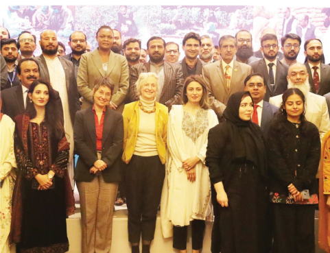
FAO and MoPD&SI organized workshop on Food Safety in Islamabad

FAO and MoPD&SI organized an Inception Workshop on Food Control System Assessment under Uraan Pakistan to address food safety challenges. Federal Minister Ahsan Iqbal stressed the need for stricter regulations to boost exports and protect public health. Experts highlighted Pakistan's food safety gaps and called for stronger compliance with global standards. The event concluded with a commitment to improving food safety regulations and trade opportunities.