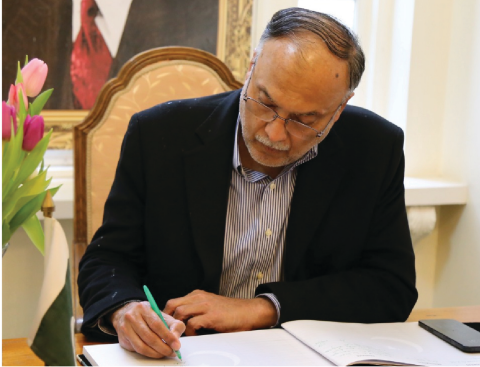
Minister Ahsan Iqbal writes a note during his visit to the Pakistan High Commission

Minister Iqbal engaged in high-level meetings with British officials, business leaders, and academics, focusing on enhancing economic ties, investment opportunities, and knowledge exchange. During his visit to the Pakistan High Commission in London, he discussed key government initiatives, including the Uraan Pakistan Economic Transformation Plan, which aims to boost exports, attract foreign direct investment, and modernize key sectors. He also encouraged the Pakistani diaspora to play a proactive role in Pakistan's progress, emphasizing their role as a bridge between the two nations.