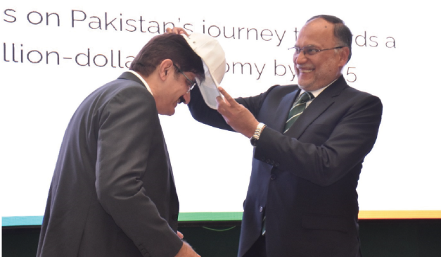
Federal Minister Ahsan Iqbal presents Uraan Pakistan cap to Chief Minister Sindh, Syed Muraad Ali Shah

The federal government launched the first consultative workshop on "Uraan Pakistan" in Karachi, bringing together key stakeholders to drive economic expansion, industrial growth, and digital transformation. Federal Minister Ahsan Iqbal highlighted major initiatives, including enhancing exports, leveraging Thar coal and renewable energy, and strengthening trade infrastructure with projects like the Sukkur-Hyderabad Motorway. The workshop emphasized policy coordination, climate resilience, and youth skill development, reaffirming Sindh's pivotal role in Pakistan's economic future.