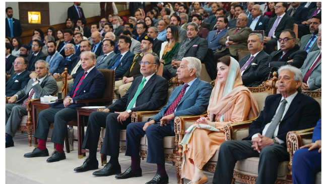
PM Shehbaz Sharif, Vice PM Ishaq Dar, CM Punjab Maryam Nawaz, Federal Minister Ahsan Iqbal and other senior leadership at the launch event of "Uraan Pakistan"