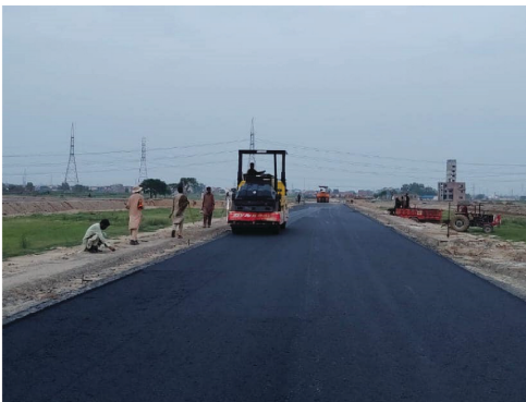
Narowal-Muridke road phase II Launched

The government has launched Narowal-Muridke Road Phase II, a 75km-long project that will strengthen road connectivity between key districts. Other major initiatives include Narowal Medical College (Rs. 4.4 billion) and Children's Learning Park (Rs. 100 million). With Rs. 28 billion allocated for road infrastructure, these projects aim to enhance connectivity, education, and economic growth in the region. The minister highlighted that this project is part of a broader effort to modernize Punjab's road network, ensuring smoother transportation for businesses, farmers, and commuters.