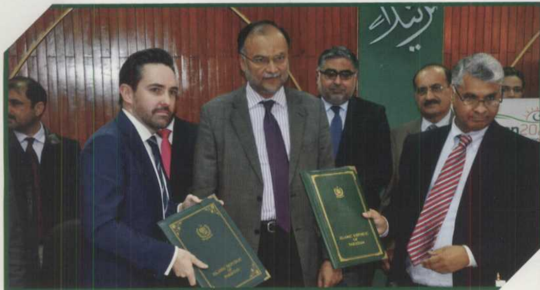
Project titled "Reform and Innovation in Government for High Performance" launched through Cost-sharing Agreement between MoPDR and UNDP.