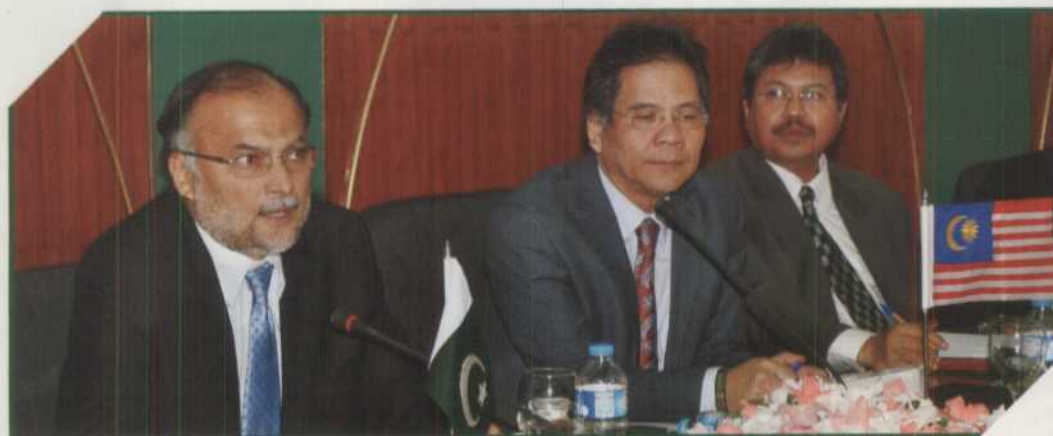
Mr YB. Senator Dato Siri Idris Jala, Minister in the Prime Minister's Department, Government of Malaysia, briefed the Prime Minister of Pakistan, Federal Cabinet, Secretaries of federal government, PIA Administration, Punjab Chief Minister and his Cabinet on lessons learnt from the Malaysian transformation programme.